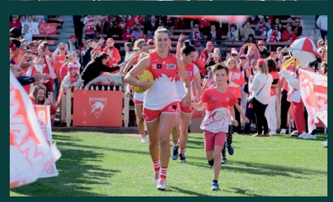
The TAL Assister Program delivers positive messages from fans to support and encourage AFLW athletes.